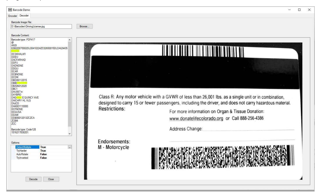
My driver license with a couple of redacted personal info

If you look at the back of your driving license, you will see a couple of barcodes. Ever wondered what kind of stuff these barcodes hide? I took a picture of my driving license and used our nifty demo program to peek into the two barcodes. Here is what I found: